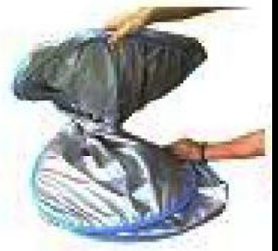
The Relax Sauna comes with a very comfortable insulated chair, and the tent folds easily.